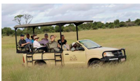
Top: Lion | Above: Safari