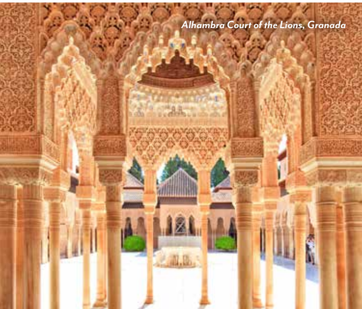
Alhambra Court of the Lions, Granada

Discover the architectural treasures and interconnected history of Portugal, Morocco and Spain, revealed through their fortified medieval towns and coastal cities. The cross-continental collaboration and joint influences of Greco-Roman, Judeo-Christian and Moorish civilizations ushered in a new era of advances in mathematics, science, medicine, horticulture and philosophy — creating the catalyst for global trade from the 15th through 18th centuries. Ships sailing from these shores to the New World brought back riches to the region, generating great wealth among this unique mélange of cultures and sparking a veritable renaissance in art and architecture. From the coasts of Portugal and Spain to the ancient maritime port of Tangier, Morocco, experience the allure of these seaside gems as you retrace voyages in the wake of mariners past.