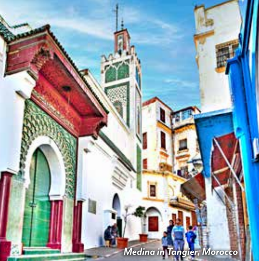
Medina in Tangier, Morocco