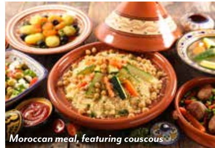
Moroccan meal, featuring couscous