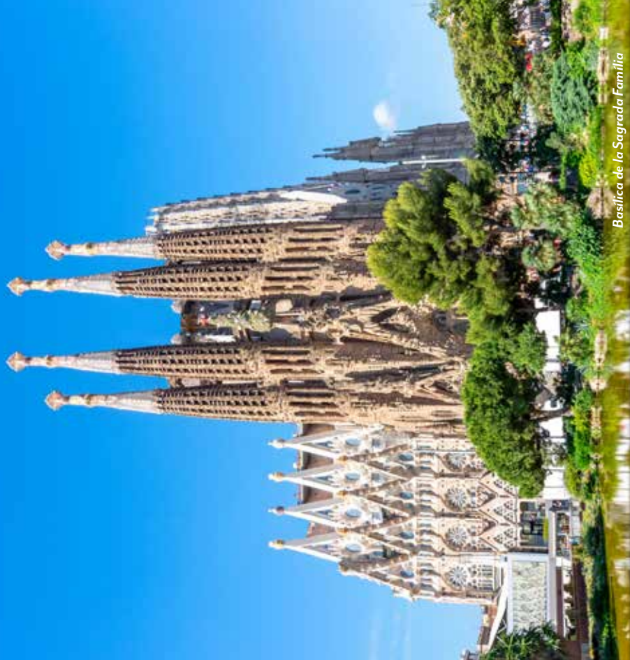
Basilica de la Sagrada Família

PRSR1 STD U.S. Postage PAID Gohagan & Company